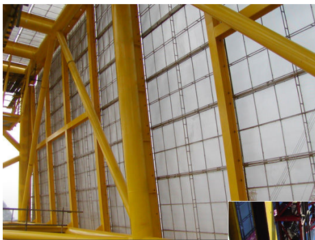
Ladder Heatshields protecting personnel working within the turret area on FPSO KIKEH