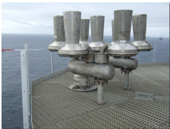
Flare Deck Heatshields replaced traditional 'Fire Brick' construction on the Forties Alpha Platform