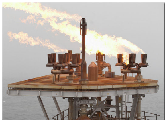
Forties Charlie replacement Flare Deck